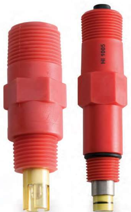
HI1000 and 2000 series