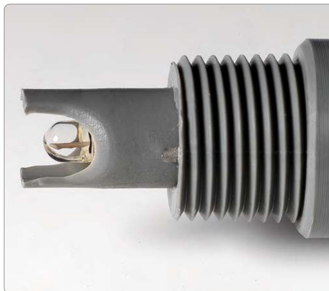
Matching pin with differential input for grounding

HI1000 and HI2000 series incorporate a BNC connector that enables connection to any pH/ORP meter quickly and easily. Models with 3 or 5 meters (9.8 or 16 feet) cable are available.